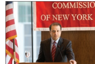
Loretta Preska , Chief Judge U.S. District Court for the Southern District of New York