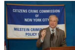
Robert Katzmann , Chief Judge U.S. Court of Appeals for the Second Circuit

Recent Crime Commission Breakfast Forums and Milstein Criminal Justice Policy Forums have featured: