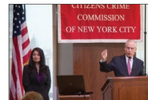
Preet Bharara , U.S. Attorney Southern District of New York